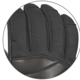
thermal insulation: Primaloft®