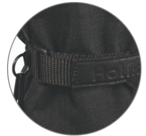
Drawstring strap with velcro fastening on the back of the glove