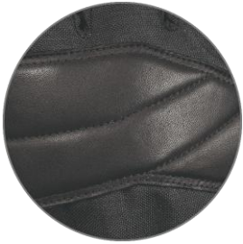
knuckle protection on the back of the hand