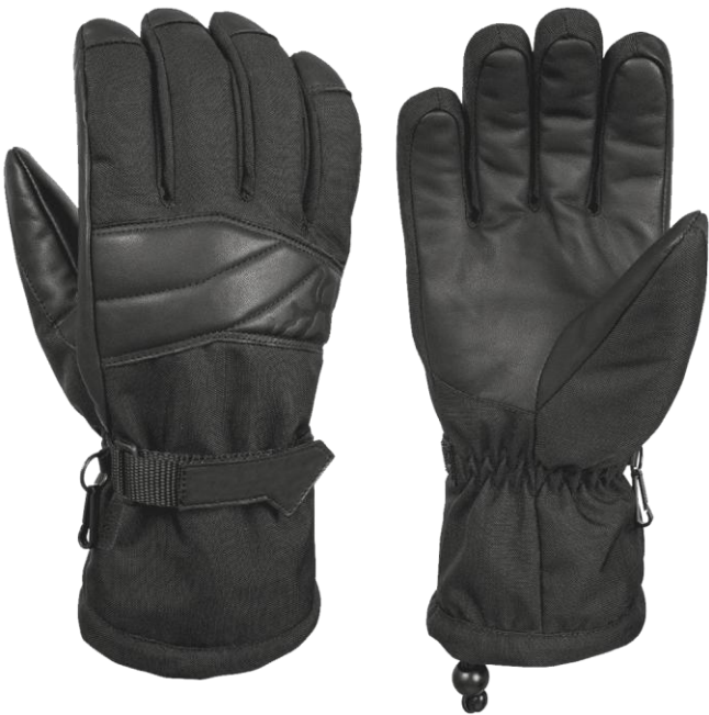
RYAN Compact Black

Winter gloves for military operations in extremely cold and wet conditions.